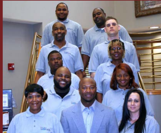
Pine Belt Works Training takes place at the

Pine Belt Works Basic Manufacturing Program provides you with the formal education foundation needed to build a successful career in manufacturing. Graduates of the 90-hour program are OSHA 10-hour certified, CPR/First Aid certified, and are familiar with advanced manufacturing concepts.